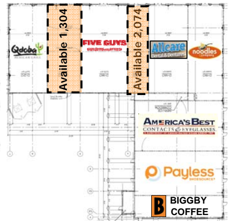
Building "D" Floor Plan